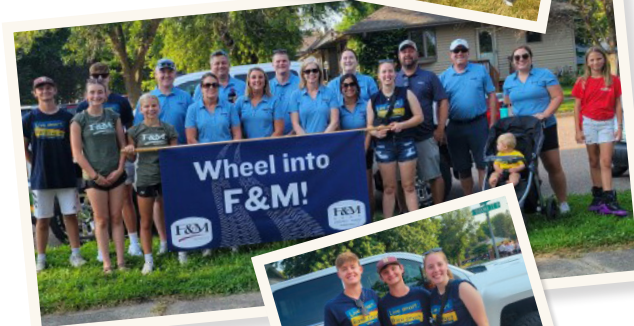
Watermelon Days Parade