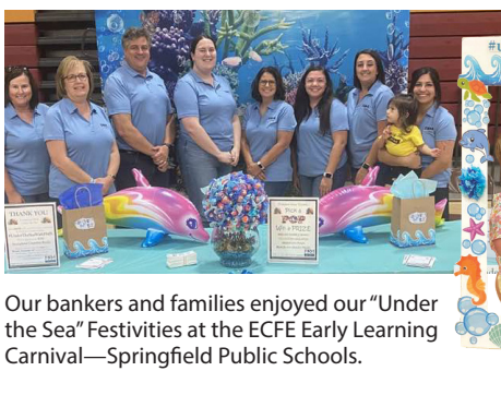
Our bankers and families enjoyed our "Under the Sea" Festivities at the ECFE Early Learning Carnival—Springfield Public Schools.

Our 'File of Life' project was a great success! We were proud to be recognized as a 2024 Community Champion by the Minnesota Bankers Association for this project. We purchased 1,000 FOL magnetic folders and provided them to seniors in our communities at no charge. Seniors are encouraged to put their important medical information in them and affix them to the refrigerator to help first responders or friends in case of emergency. Our bank team members raised money for this project through our 'Denim for a Cause' program. If you would like one for your home or loved one, let us know.