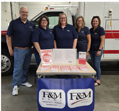
Our bankers distributed FOL folders at the Morgan Fire Dept 9-11 event