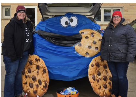
Cookie Monster joined us for some Halloween fun at Zion Ev. Lutheran Church in Morgan.